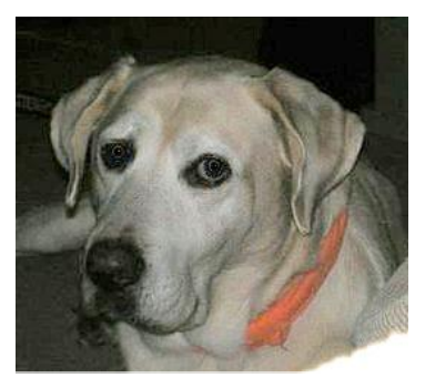
Pet safety.

Keeping your pet safe during hunting season is also very important. Blaze orange vests, collars, and bandanas are available for dogs and will fit other pets of similar sizes. Attaching a small bell to your pet's collar can also help distinguish it from other woodland animals.