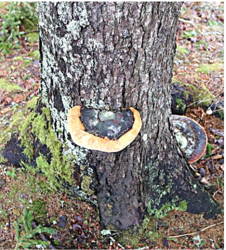
Decay conks.