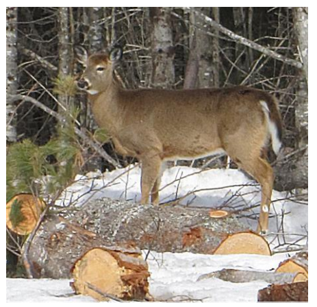
White-tailed deer.

Although these requirements are for hunters, landowners should follow them when working in the woods during hunting season. If you don't