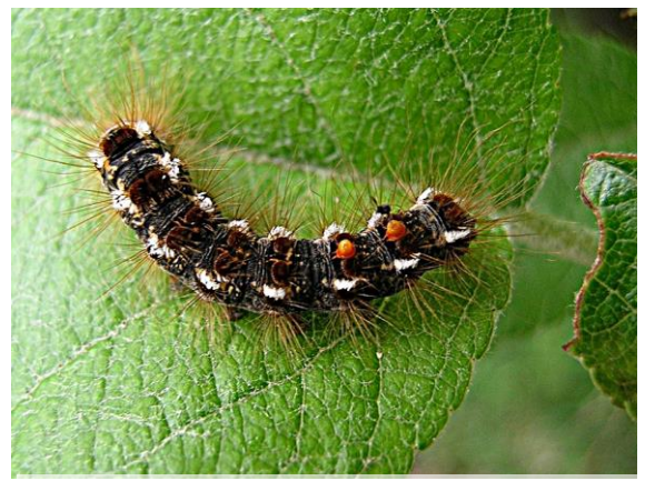
Browntail moth.

The browntail moth caterpillar has tiny poisonous hairs that cause a skin rash similar to poison ivy on sensitive individuals. People may develop dermatitis from direct contact with the caterpillar or indirectly from contact with airborne hairs. The hairs become airborne by being dislodged from the caterpillars or by being cast off when the caterpillars