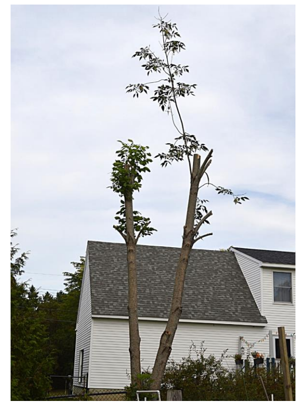
Topped tree.

Although trees often become hazards naturally, people can injure and weaken trees in many ways. For instance, improper pruning practices can negatively impact tree health and resistance to breakage. As mentioned previously,