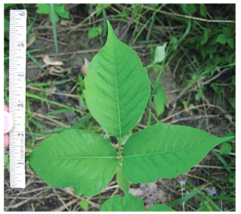
Poison ivy.

Other plant parts that can help you identify poison ivy include the fruit and the roots. The fruit is a creamy white, ribbed, globular, BB-sized berry; and the roots are often covered in reddish hairs.