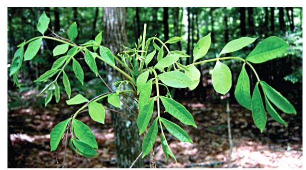
Poison sumac.

The leaves of poison sumac are 7 to 14 inches long and are composed of 7 to 13 smaller leaves.